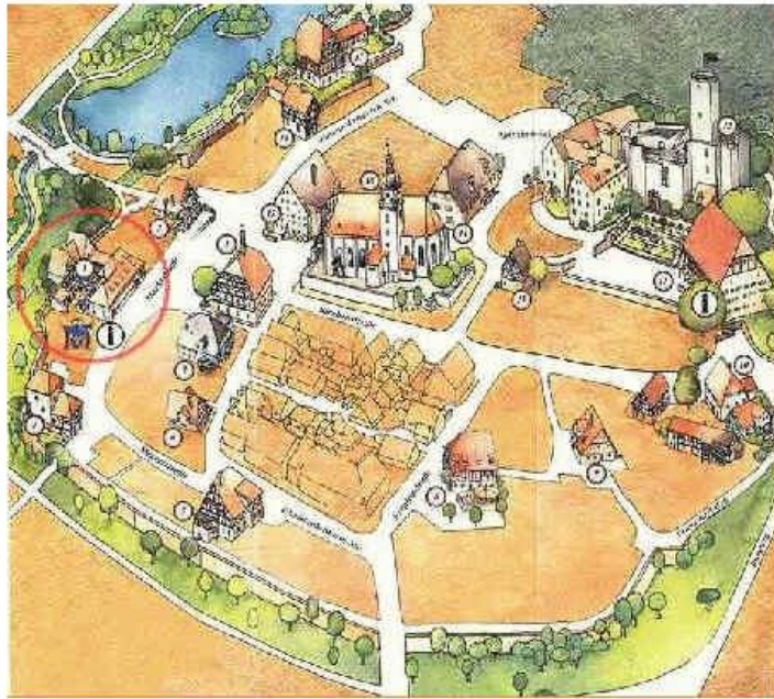
"Schwarzen Roß" - Marktstraße 10 - 91161 Hilpoltstein - Tel. 09174/4795-0 - Fa Anfahrt